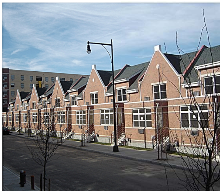
MAP built these houses on the former site of the Rheingold Brewery in Brooklyn's Bushwick neighborhood.